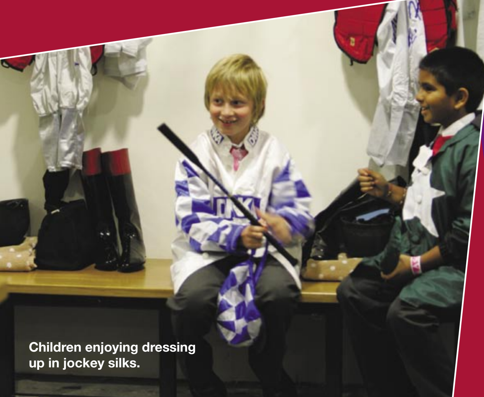
Children enjoying dressing up in jockey silks.